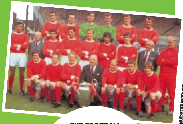
MANCHESTER UNITED 1960

* Try designing a football strip for Manchester United in 40 years time.