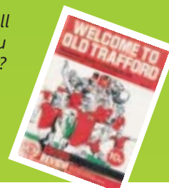
The players on the left are, David Beckham, Nicky Butt, Andrew Cole George Best and Nobby Stiles

YOU ARE MY SOLSKJAER, MY OLE SOLSKJAER, YOU MAKE ME HAPPY, WHEN SKIES ARE GREY. OH ALAN SHEARER HE MIGHT BE DEARER BUT PLEASE DON'T TAKE, MY SOLSKJAER AWAY